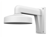
HIA-B401-110T Wall Mounting Bracket